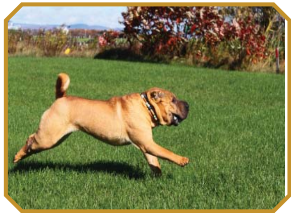
Kenzo running free and healthy