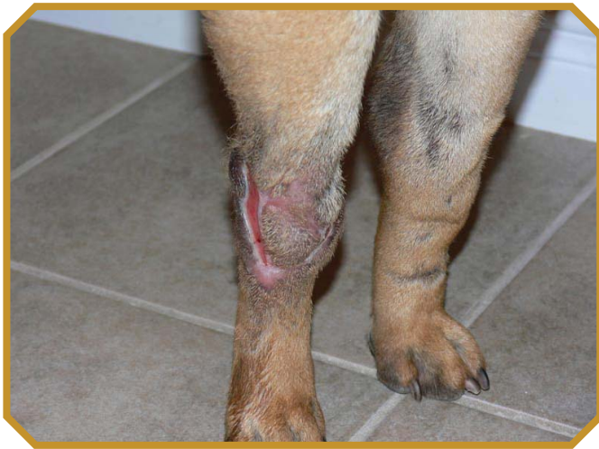
Kenzo's Infected Leg

Kenzo is a survivor of Streptococcal Toxic Shock Syndrome (STSS) .